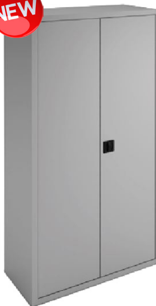
ART.SB.B0002010 METAL CLOSET WITH DOORS

Cabinet with hinged doors made of sheet steel, complete with four adjustable internal shelves on a rack also arranged for the insertion of hanging folders. Equipped with lock.