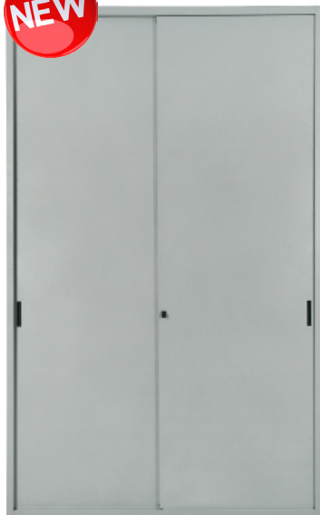
ART.MS.ME618 METAL CLOSET WITH SLIDING DOOR depth. 60 with 8 shelves cm.180

Sliding door cabinet made of steel sheet, complete with eight internal adjustable shelves set up on a rack also prepared for inserting hanging folders.