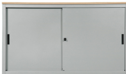
ART.SB.BST00818 METAL CLOSET WITH SLIDING DOOR WITH MELAMINE TOP

Structure in painted steel sheet, complete with 1/1 internal shelves adjustable in 3 cm steps; prepared for inserting suspended files. Equipped with a glazing unit and a melamine top.