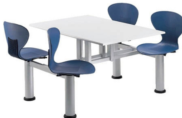
ART.160BL CLUSTERS SEATING 4 SEATERS

Monoblock table with swivel seat. Supporting structure completely in 2 mm thick steel painted with black anti-scratch thermosetting powders.